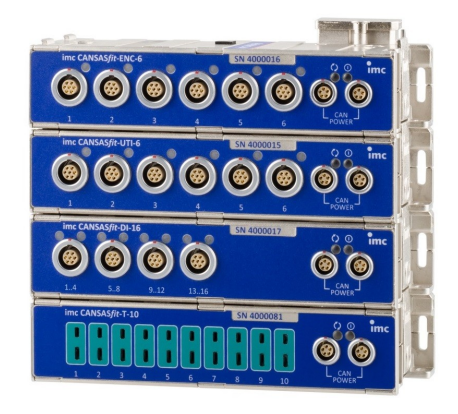
imc CANSAS fit modules connected in a block (click mechanism)

• Fastening eyelets provided for installation with cable ties, srews or bolts