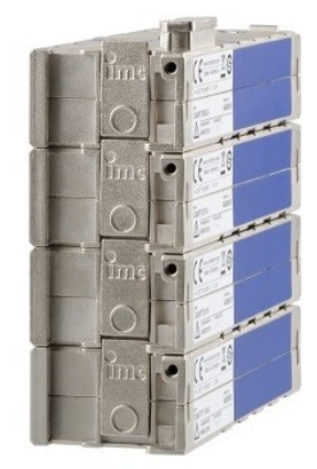
Latching mechanism and protective cover for click mechanism