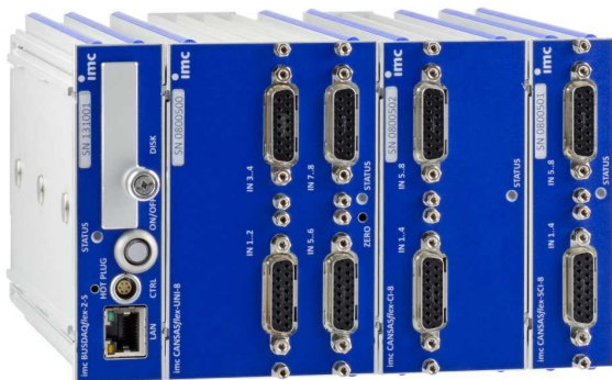
imc CANSASflex modules connected (click-mechanism) in a block with imc BUSDAQflex logger (left)