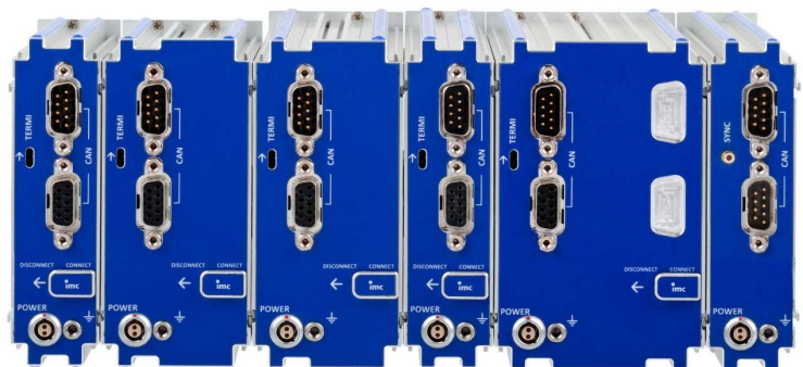
rear view of this block: CAN, power supply, terminator, locking slider